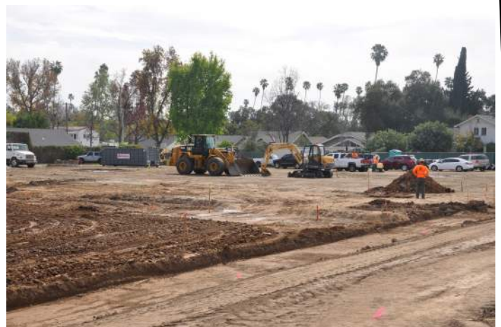
Middle School Hard Court & Field Project