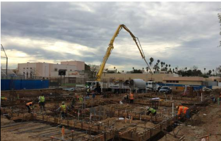
High School S.T.E.M. Building

The team is working to re-evaluate the structural and seismic requirements for the old gymnasium in order to review potential costs savings with the design. As such, the team anticipates submittal to the Division of State Architects by June 2018.