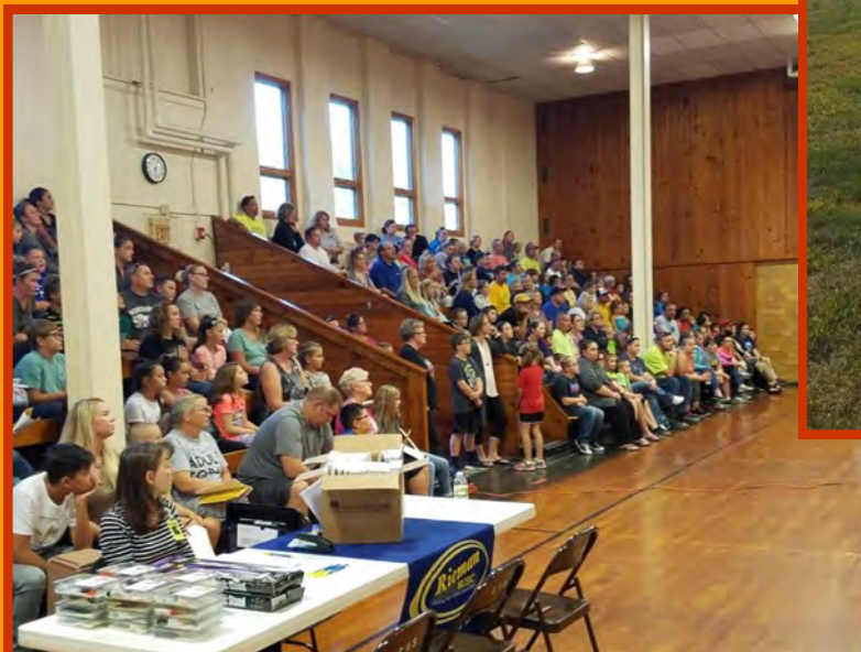
Parent meeting for band.