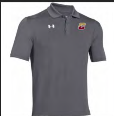
Under Armour Team Armour Performance Polo $39.00