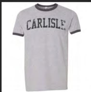
Anvil Lightweight Ringer Tee $16.00

Items will be delivered to school. Deadline to order is September 14.