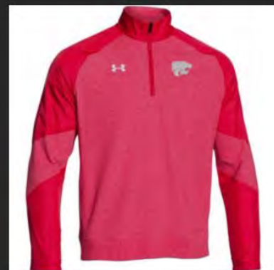
Under Armour Team Performance Fleece 1/4 Zip $51.00