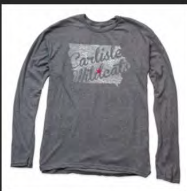
American Threads USA Spun Long Sleeve Tee $23.00