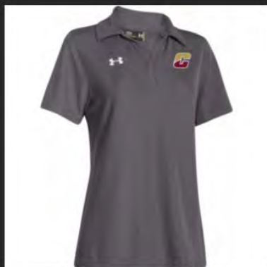
Under Armour Women's Performance Polo $39.00