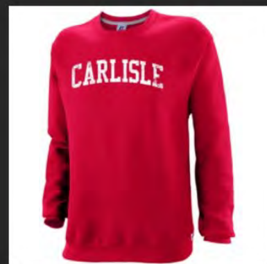
Russell Dri-Power Fleece Crew $21.00