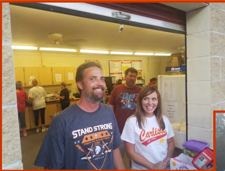
Fifth grade parents working concession stand to raise funds for Y-camp.

We are off and running at Hartford and students and staff are working extremely hard so that we will have a successful year in the classroom and beyond.