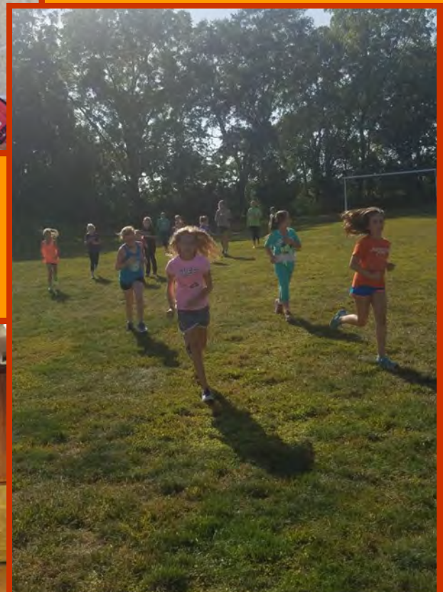
Girls on the Run