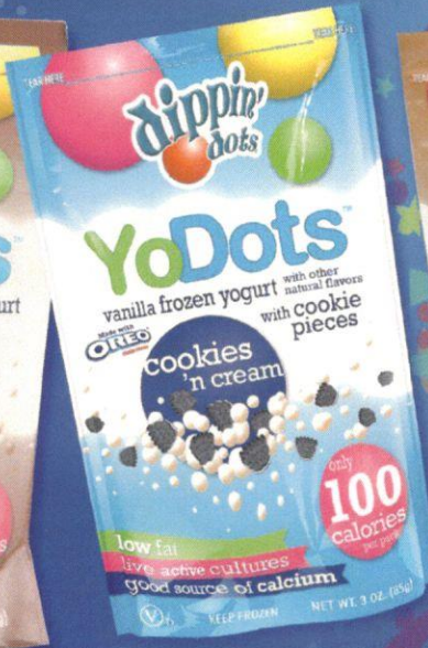
Cookies 'n Cream