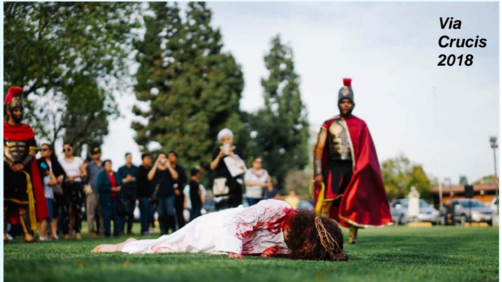
Via Crucis 2018

Ese ritmo binario de entregar la vida e iniciarla de nuevo no es más que un eco del Señor Jesús y de la manera que él escogió vivir entre nosotros. Fue el mandamiento que su Padre le dio, engendrado en sus huesos y en su espíritu, y es un mandamiento que sigue vigente en nuestra vida. — J.S. Paluch Co.