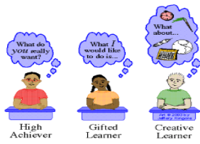
Response to an Assignment