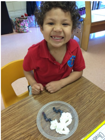
PreK 4 learned about weather and clouds this week!!!

Our DONATE Button is now up on our website! It is the far right box right above School News!