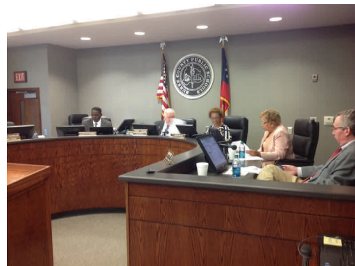
"Paperless" Board of Education Meeting

A major portion of all documentation called for in this process can be found on eBOARD System Leadership Planning (SLP) agendas.