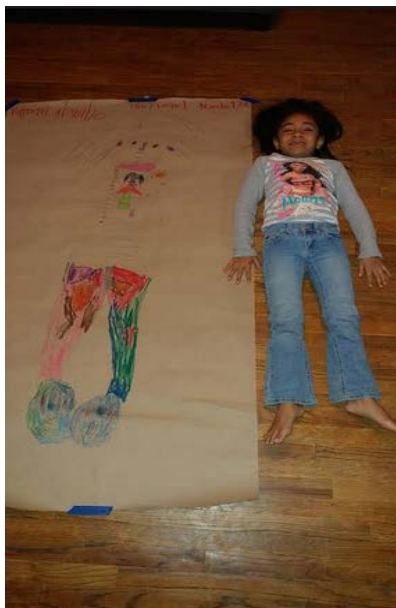
The Cube Museum Field Trip