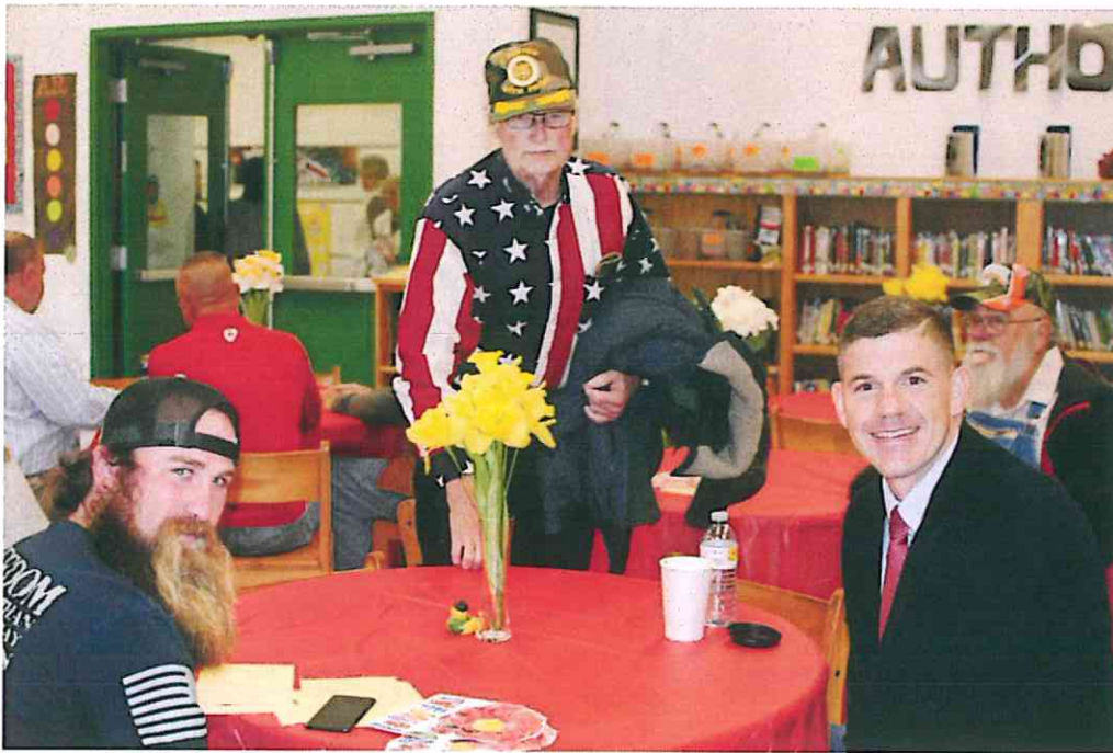
THANK YOU VETERANS FOR SPENDING TIME WITH US ON NOVEMBER 10, 2017. THANK YOU FOR THE SACRIFICES YOU MADE FOR US.