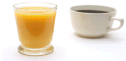
Coffee and Juice