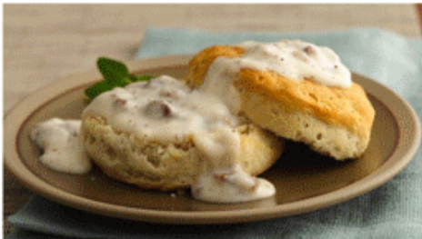
Biscuits and Gravy