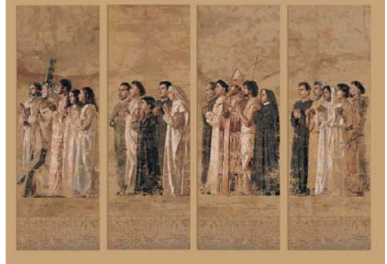
Tapiz de Comunión de los Santos

Están invitados a una Misa especial el Día de todos los Santos, día de obligación. Celebraremos a esas vidas que son ejemplo en nuestra Fe.