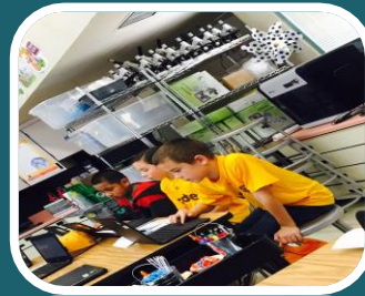
Developing 21 st Learners and Leaders...

At Live Oak Elementary we believe that students succeed in an atmosphere where children are engaged, take responsibility for their learning, and respect themselves and others, therefore, a safe learning environment, high standards, and leadership goals are of greatest priority. As a professional learning community, we believe in the worth of every student, and as a result, strive to enable each child to become a self-confident, skilled, and successful citizen, ready to embrace college and career goals. It is our collective mission and expectation that the 7 Habits of Highly Effective People and the philosophies of the Leader in Me , will be developed, modeled, and fully integrated in everything we do at L.O.E. as we move toward achieving Lighthouse status from the Covey organization.