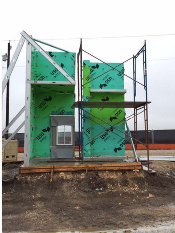
Steel joist onsite waiting to be installed, digging grade beams at CTE yard and mock up panel being constructed.