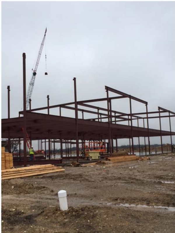
Steel erection underway at Area "H" (Cafeteria), Area "K" (Auditorium) and Area "E" (Two-story classroom area).