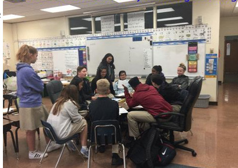
We Act in their Wednesday Morning meetings

The class (and teacher) with the most donations will receive a prize!