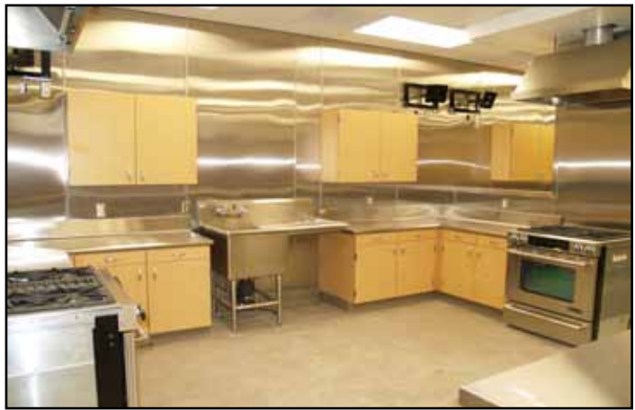
The Culinary Arts classroom, which was built in 1963, is redesigned to feature seven new stainless steel kitchens, each with a closed circuit TV capability connected to the instructor's demonstration kitchen.