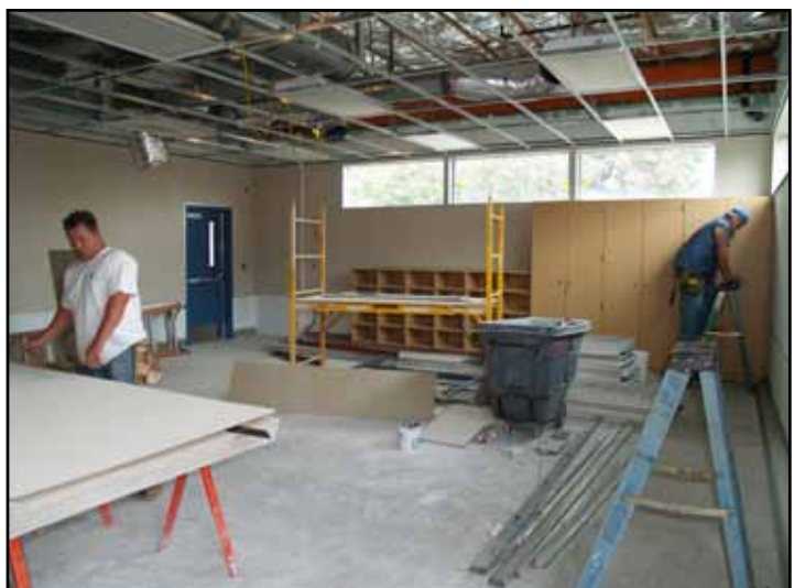
Interior of Golden JAR view from kitchen to dining area.