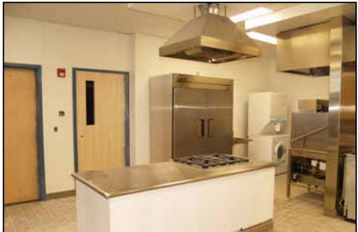
Culinary Arts classroom facing teacher demonstration table and new walk-in refrigerator and washing machine.