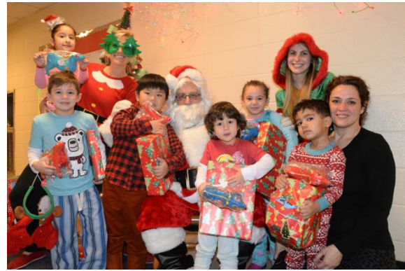
Students were thrilled to see Signing Santa! Click on the photo to see more images of Santa and the students.

Windsor Park provided a holiday present for each of the students in preschool and elementary school, in addition to a pizza party for the middle and high school students. The children were thrilled to receive presents and converse with Santa and his elf using sign language.