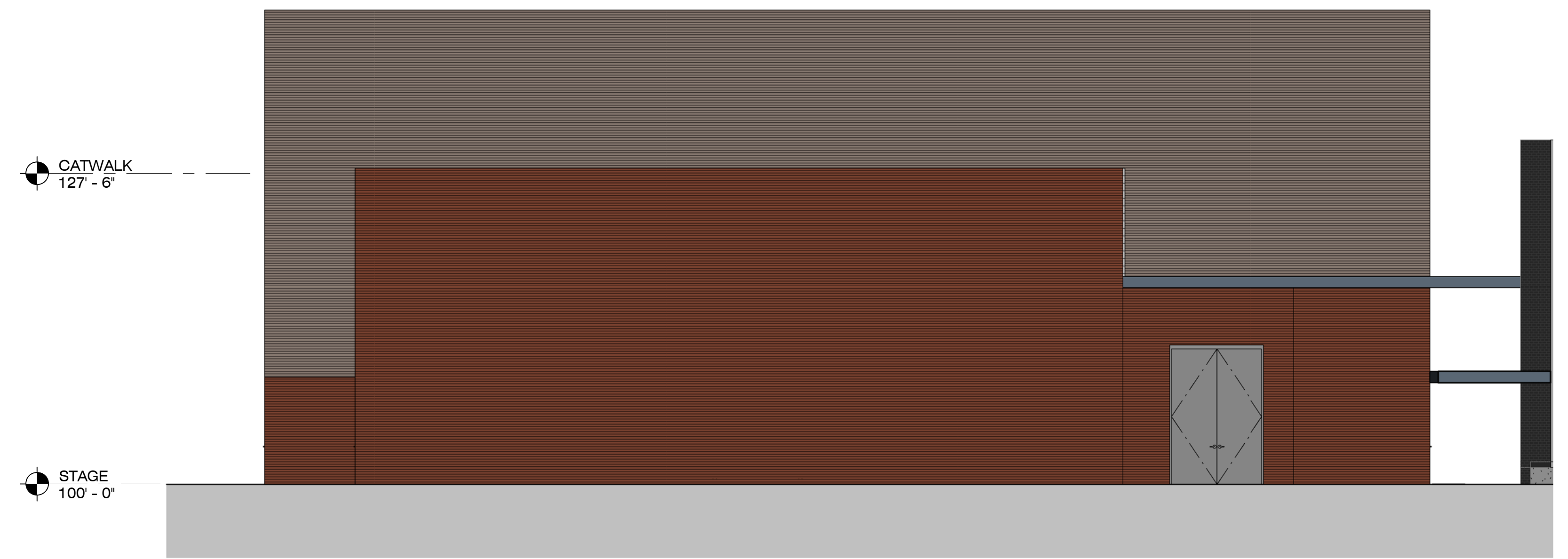
2 WEST ELEVATION SCALE: 1/8" = 1'-0"