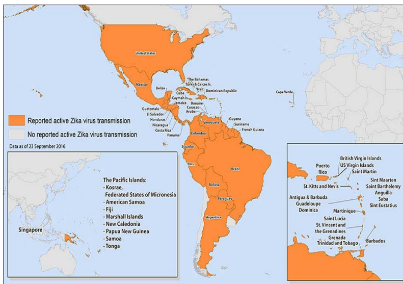
All Countries & Territories with Active Zika Virus Transmission; U.S. Centers for Disease Control and Prevention, November 2016

Since the emergence of Zika in Brazil in 2015, Zika virus has spread rapidly throughout Latin America and the Caribbean. Currently, Zika outbreaks are ongoing in 61 countries and territories, including in Mexico, where the highest numbers of cases are in the southern part of the country. However, the U.S. Centers for Disease Control and Prevention considers any travel to Mexico to be a risk for Zika infection. Individuals have been infected in popular tourist destinations including Cancun, Acapulco, Cabo San Lucas, Puerto Vallarta, Ixtapa, and Mazatlan. While no local transmission has been reported in the border region of Baja California, the mosquitoes that transmit Zika virus are present and local transmission is possible in the region. Active Zika virus transmission in the United States and U.S. territories has only been identified in Miami-Dade County in Florida, Cameron County in Texas, Puerto Rico, U.S. Virgin Islands, and American Samoa.