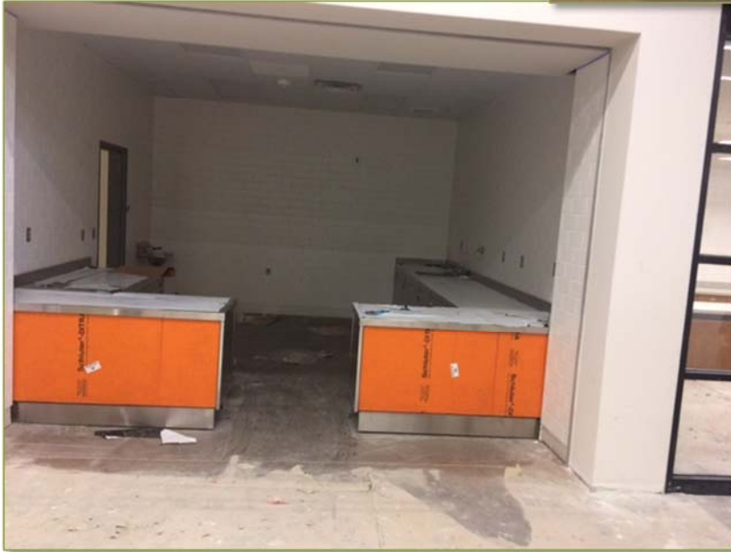
CTE Culinary Kitchen, Cosmetology and Beverage Area