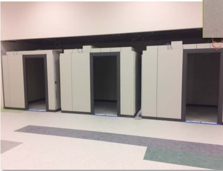
Band and Choir practice rooms being installed and band storage system installed.