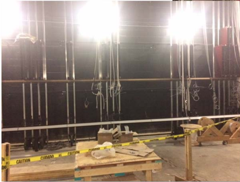
Auditorium finishes and stage rigging being installed.