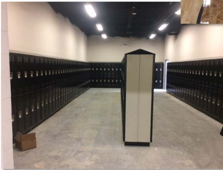
Terrazzo at Auditorium Lobby, finished gym floors and lockers being installed.