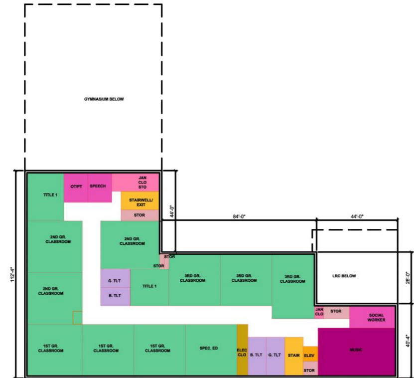
SECOND FLOOR CONCEPT PLAN - 15, 865 SF