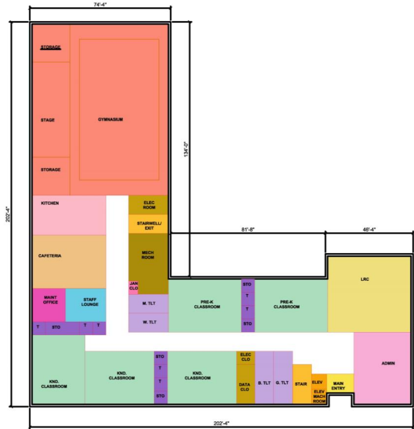
FIRST FLOOR CONCEPT PLAN - 23,343 SF