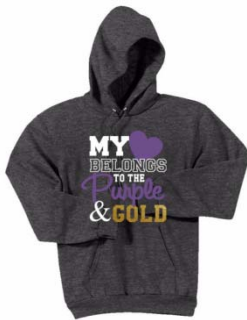
Port & Company - Classic Pullover Hooded Sweatshirt