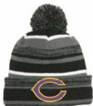
New Era Sideline Beanie