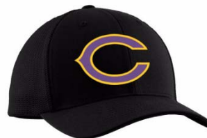
Port Authority Flexfit Mesh Back Cap