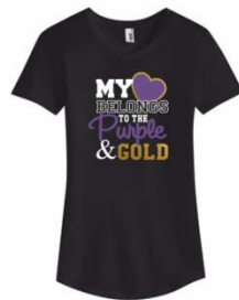
NEW Anvil® Ladies Tri- Blend Tee