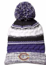
Sport-Tek Pom Pom Team Beanie