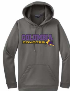
Sport-Tek Sport-Wick Fleece Hooded Pullover (Performance)