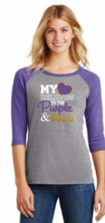
District Made® Ladies Perfect Tri™ 3/4-Sleeve Raglan