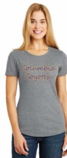
NEW Anvil® Ladies Tri- Blend Tee Rhinestone