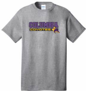
Port & Company 5.4-oz 100% Cotton T-Shirt

Online Store Deadline: October 18th, 2016 (11:59pm)