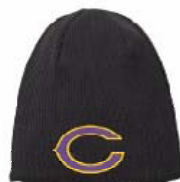
New Era Knit Beanie