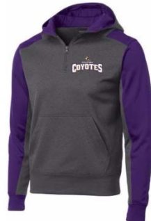
Sport-Tek Tech Fleece Colorblock 1/4-Zip Hooded Sweatshirt Embroidered