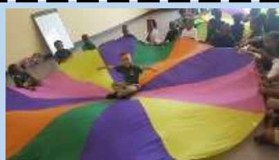
(Above) Kinders enjoying PE!