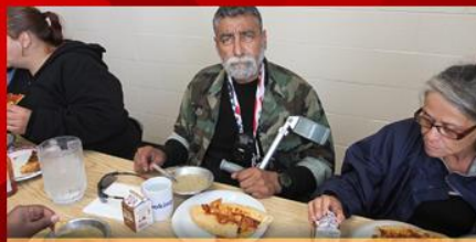
Our Christmas table STARTS WITH YOU