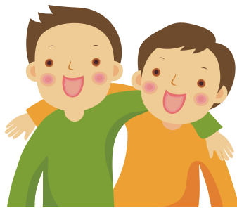
Fun with Friends

The goal of the Falcon's Nest is to provide a safe, pleasant, informally structured environment in which a variety of activities that promote the spiritual, emotional and intellectual growth of each child are available.