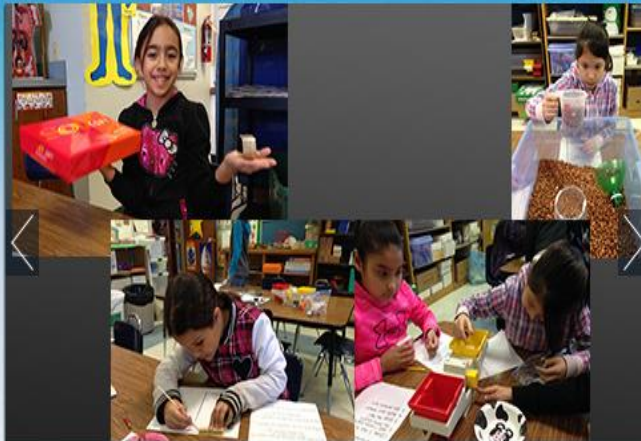
Hands on learning at Dudley Elementary with measuring length, capacity and weight