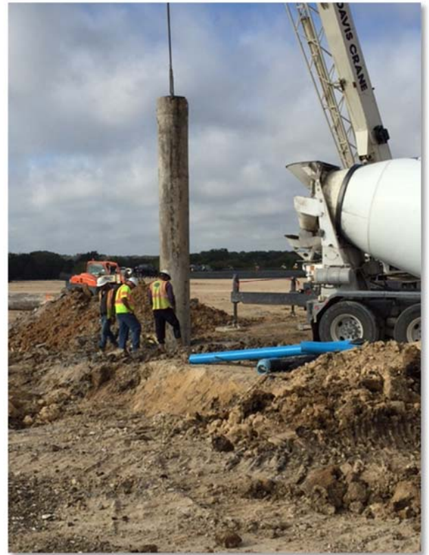
Paving pours at East Parking Lot and Loops Roads. Continuing to drill building piers - +/-1,100 piers drilled to date.