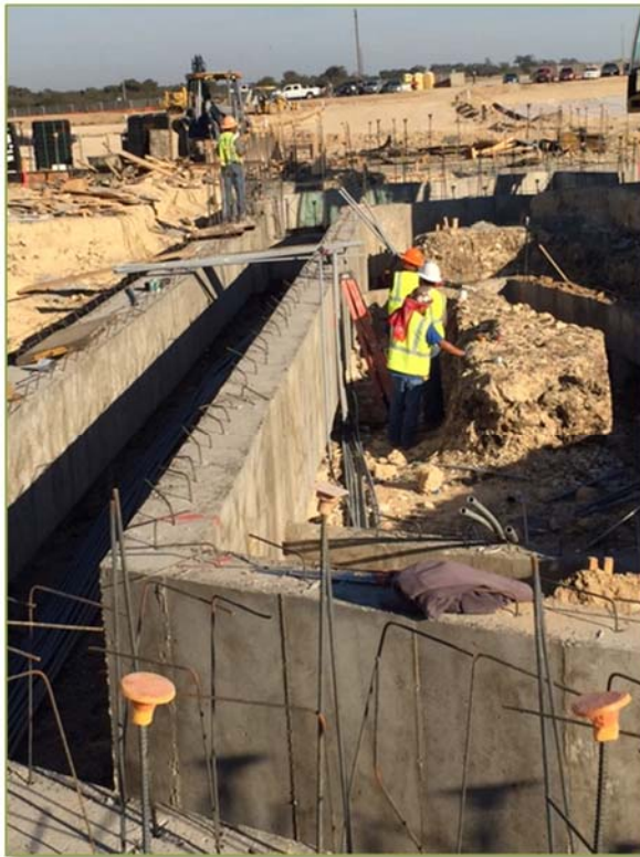
Grade beam forming continuing in "Area K" and Area "H". Wrecking forms of grade beams in "Area K". Starting to install MEP underground at "Area K".