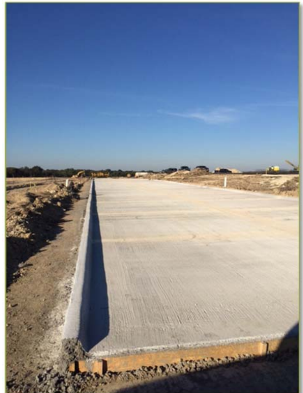
Paving rebar installed at East Parking Lot in preparation of making pour. Concrete poured at South Loop Road. Liming Visitor parking lot at north main entry.