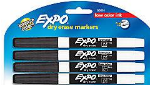
4 pack- THIN BLACK Whiteboard Markers