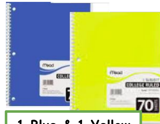
1 Blue & 1 Yellow Spiral Wide Rule 70ct notebooks