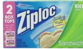
Sandwich Ziplock Bags