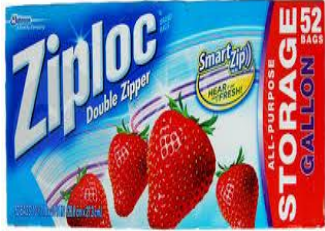
Gallon Ziplock Bags