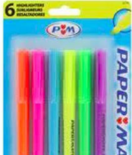
6 pack Orange, Pink, Blue, Yellow, Green, Purple