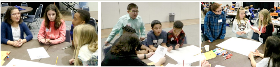
Students from Charles Evans & Lincoln 5th grade classes participated in the Meaningful Economics & Entrepreneurship Competition at the Ardmore Convention Center.