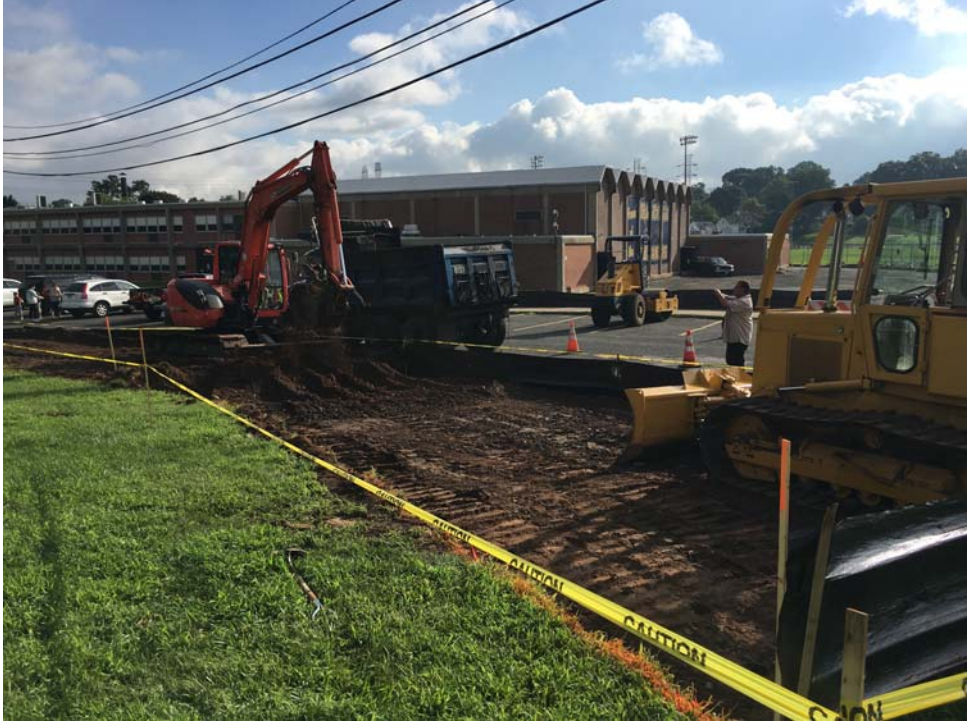
August 2018: Belleville HS – Excavation for the parking lot extension for HS front parking area.