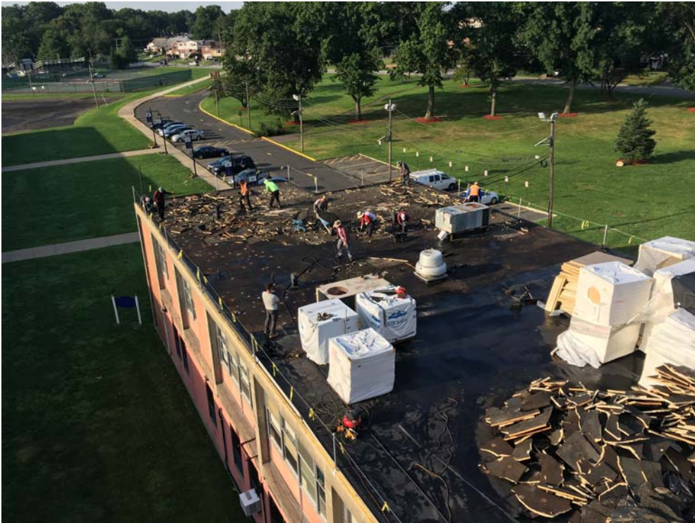
August 2018: Belleville HS – Roof replacement activities commence on Roof D2.