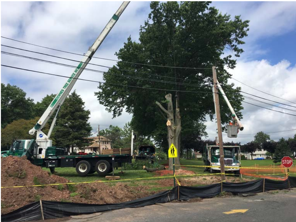
August 2018: Belleville HS – Specified Tree removals at front of HS for Parking Lot Improvements.