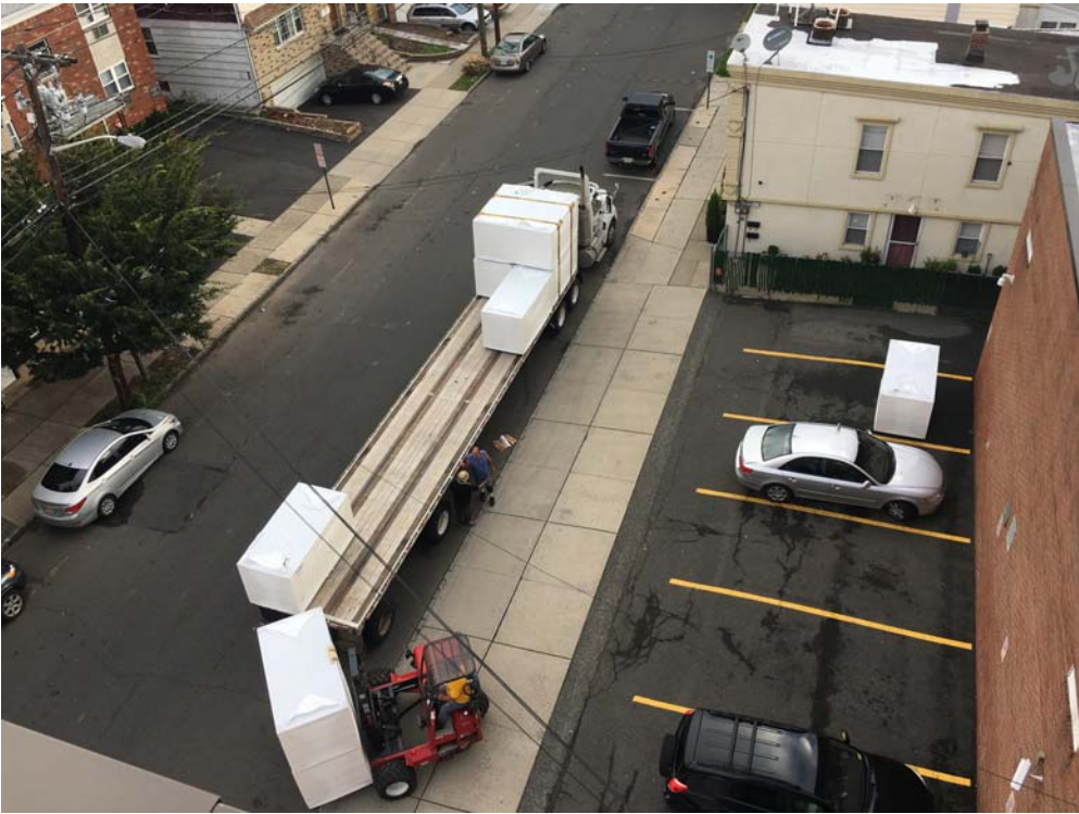
August 2018: Belleville ES #4 – Roofing materials being off loaded at ES #4.