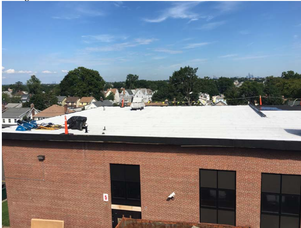
August 2018: Belleville ES #3– Cap Sheet substantially completed at Roof C1.