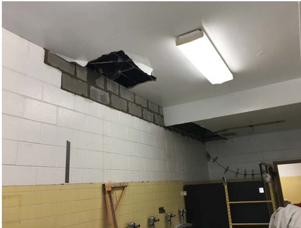
August 2018: Belleville HS –Wall restoration in first floor Student Toilet #106.