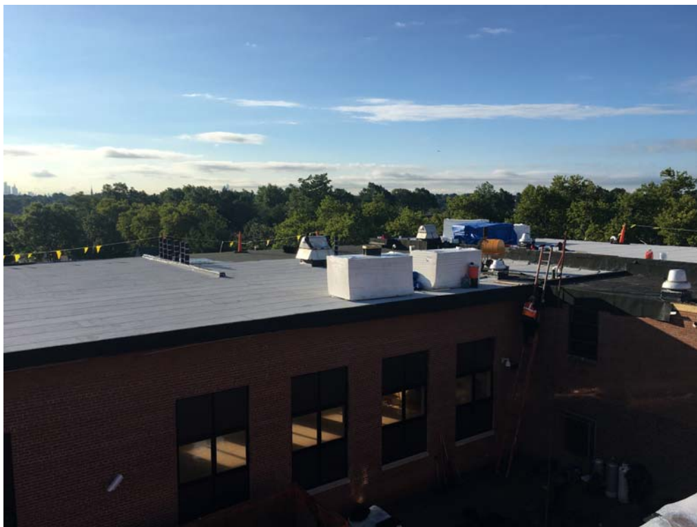
August 2018: Belleville ES #3 – Cap Sheet substantially complete Roofs C1 & B.