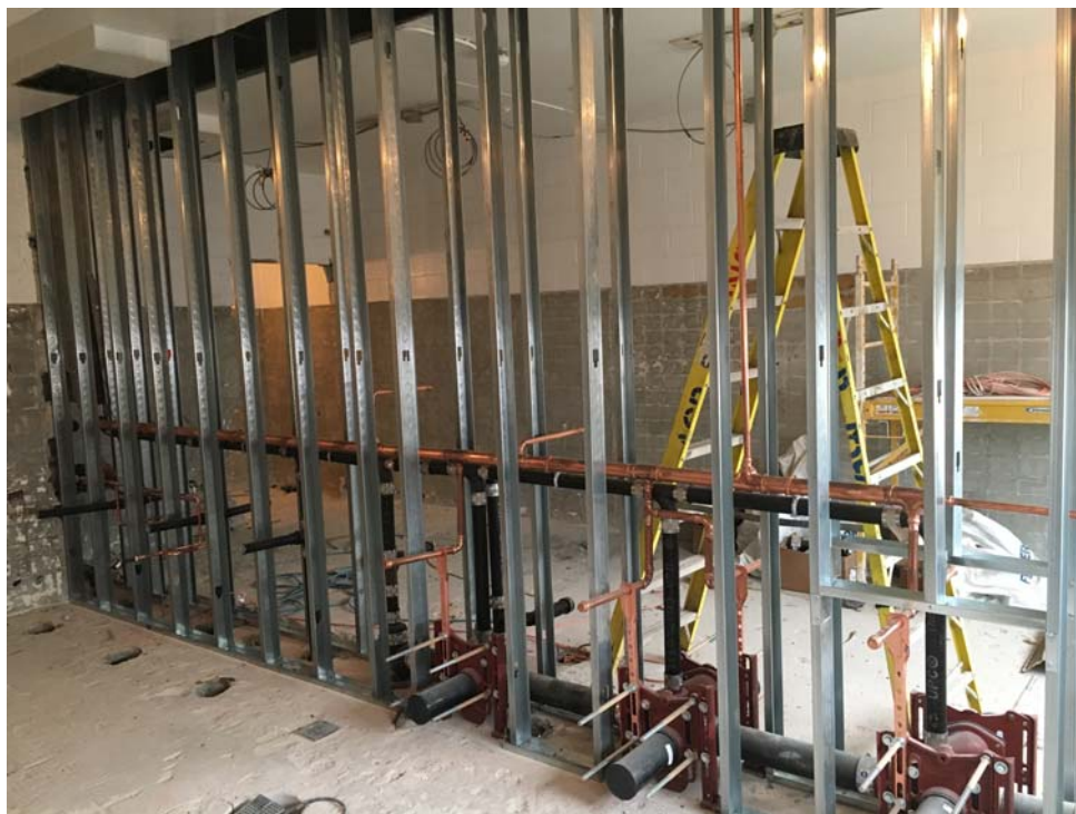
August 2018: Belleville HS – Installation of metal stud framing in 2 nd floor student toilets #206 & #208.