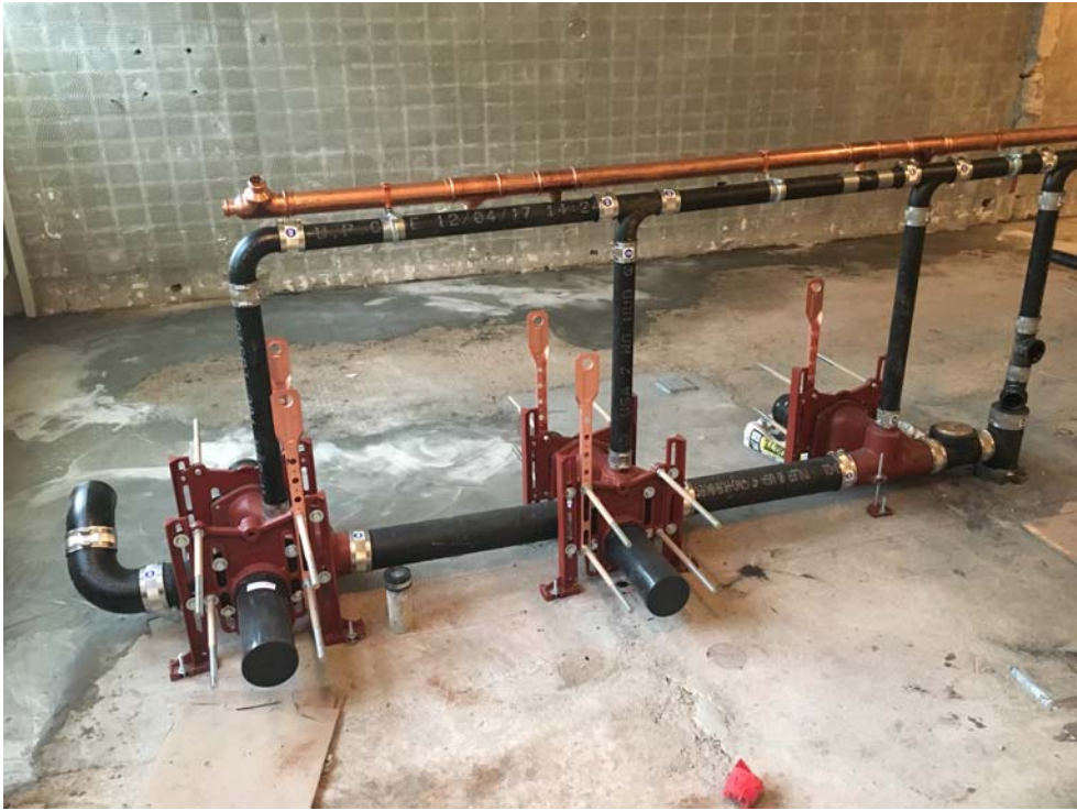
August 2018: Belleville HS –Above slab plumbing rough-ins at 2nd floor Faculty Toilets #242 & #245.