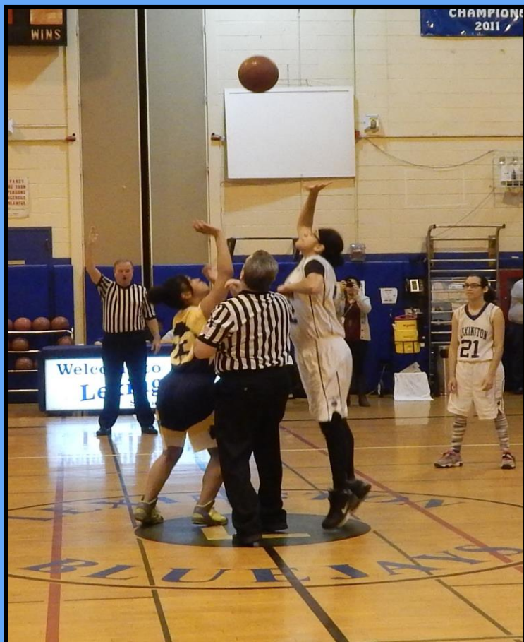
Girls' Varsity Basketball Team

Lexington School and Center for the Deaf 30th Ave & 75th St, Jackson Heights, NY 11370 718-350-3300 - www.lexnyc.org - info@lexnyc.org