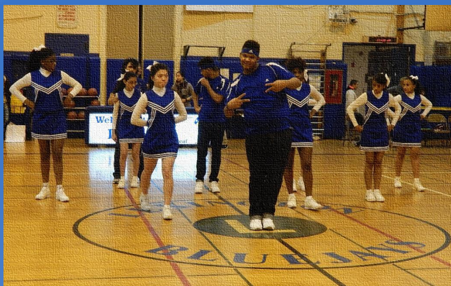
Lexington's Cheerleading Team