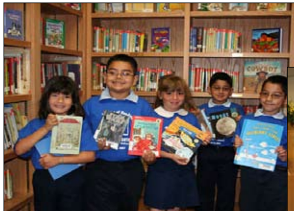
Students are excited about reading in their new Wonder of Reading Library! Above: First library to open was Hollingworth Elementary; Right: Rorimer Wonder of Reading Library opened on December 10.

New 1,920 sq. ft. libraries, including casework, windows, doors, flooring and CAT5/Data Drops