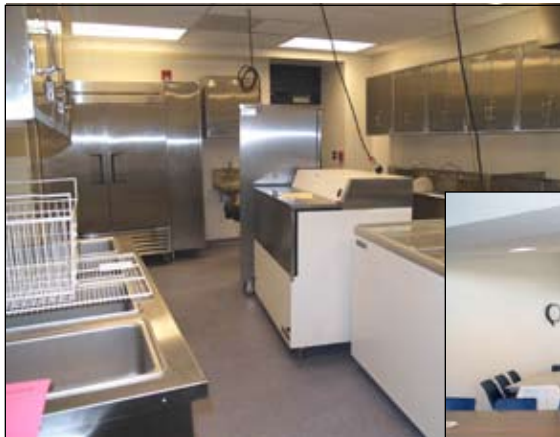
New kitchen at Villacorta.