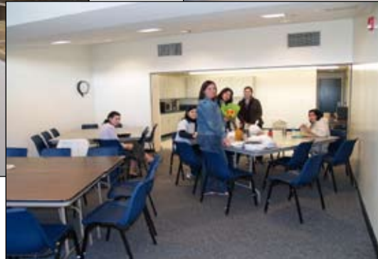
Teachers love their new lounge and kitchen!

New Covered Exterior Eating Area for Students New Staff Lounge, Kitchen and Teacher Prep Room New Ceiling, Lights, Heating and Air Conditioning New Cafeteria and Kitchen New Sewer, Water and Electrical Services