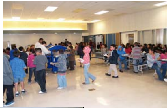
Villacorta students enjoy new cafeteria.