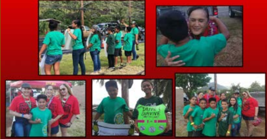
NES Preschool at their annual play day at Ewa Mahiko District Park