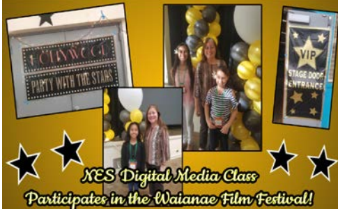
NES Digital Media Class Participates in the Waianae Film Festival!