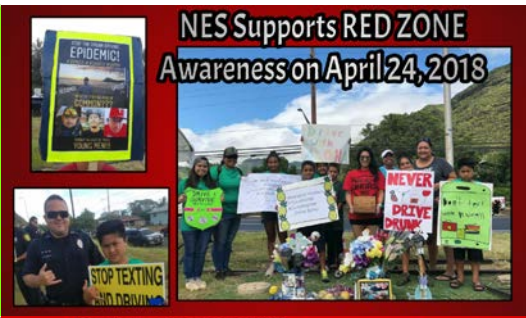
NES Supports RED ZONE Awareness on April 24, 2018