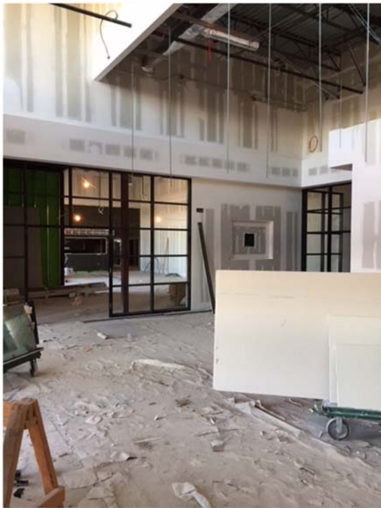
Sheetrock and tape and bed, storefront installation ongoing in CTE area