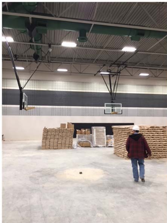
Wood floor substrate going down in the competition gym and soon to start in practice gyms.