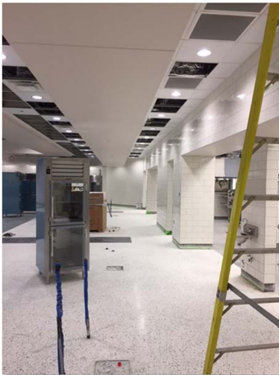
Kitchen equipment being installed.