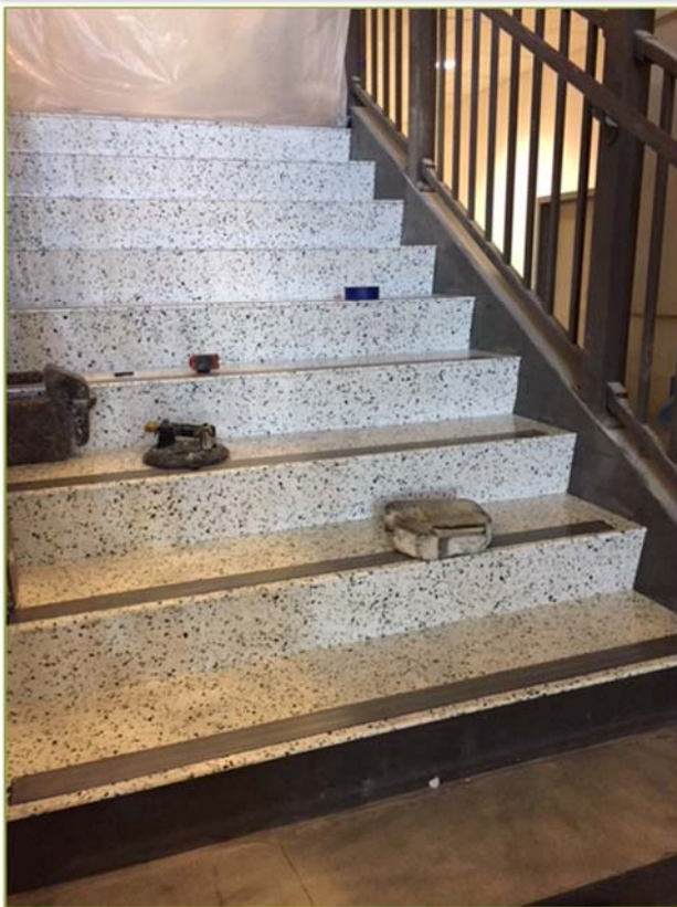
Carpeting installation underway at the Administration Area, Terrazzo stair treads installed and respread of topsoil getting place ahead of sidewalks/landscape starting.