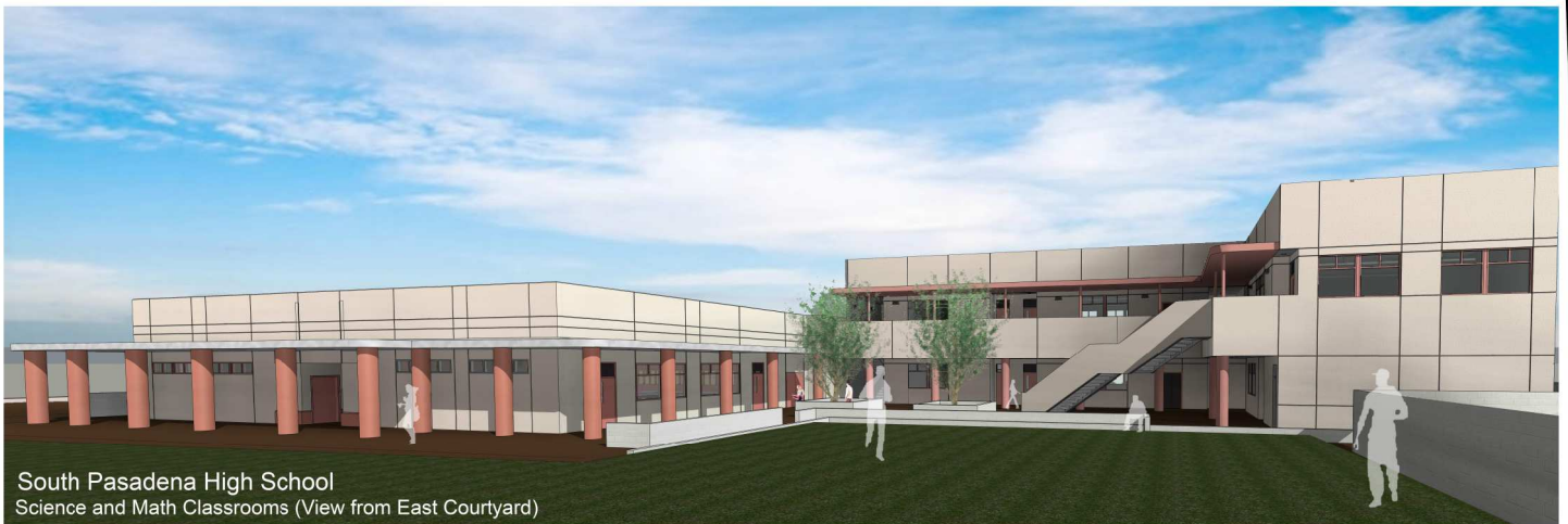
South Pasadena High School Science and Math Classrooms (View from East Courtyard)

* Week of November 6, 2017 Start of Demo and Grading