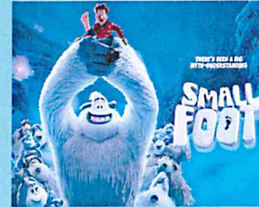
Field Trip: Movies "Smallfoot" *Activities subject to change

Come explore the park and have an opportunity to enjoy the nature and scenery this fall break! The 5-day camp offers children an outdoor recreation experience filled with science and nature, sports, arts and crafts, and exciting outings. This is a great opportunity for your child to interact in a friendly environment while making new friends. (Ages: 5 to 13)