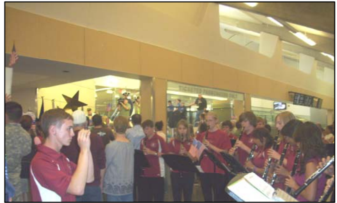
MLHS Band Performing for Honor Flight

The MLHS marching band participated in the Autumn Leaf Festival in Leavenworth. They won 1st place in their division with a total of 29 bands in the parade. This is the second year for the band to attend this parade and win 1st place. Our band students have also been busy playing for Honor Flight at the Spokane Airport for our returning military.