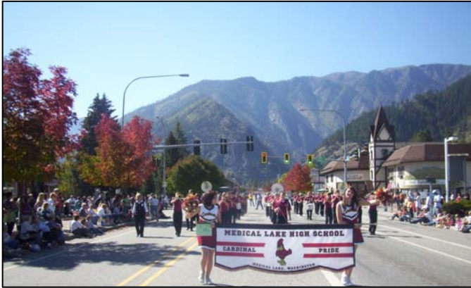
MLHS Band in Leavenworth