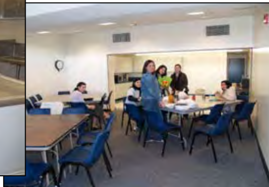
Teachers love their new lounge and kitchen!

New Covered Exterior Eating Area for Students, New Staff Lounge, Kitchen and Teacher Prep Room, New Ceiling, Lights, Heating and Air Conditioning, New Cafeteria and Kitchen, New Sewer, Water and Electrical Services