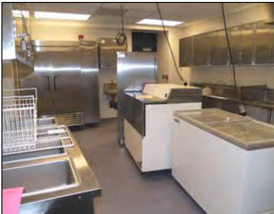
New kitchen at Villacorta.