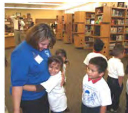
La Seda Elementary's Wonder of Reading Library opened March 21.