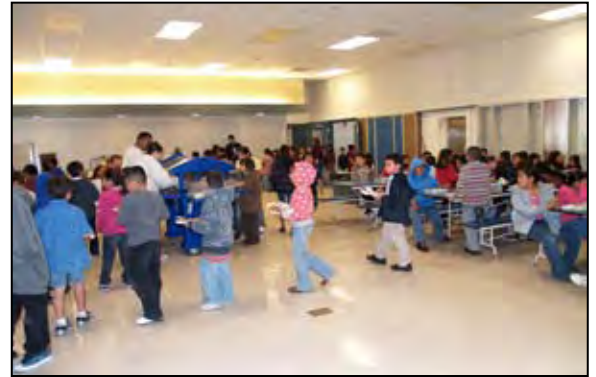
Students enjoy their new cafeteria.