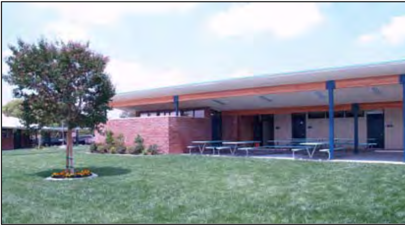
New Multipurpose Room, Staff Lounge and Teacher Prep Area.