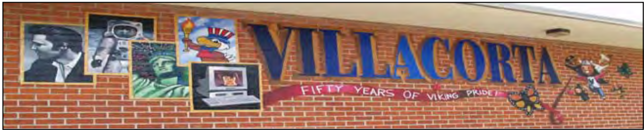
Villacorta Principal Elaine Ganiko and PTA surprised the school with a new mural on the modernized multipurpose room, featuring icons to celebrate each decade the school was open. The 50th Anniversary Celebration was held May 30.