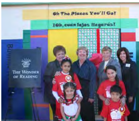
Rorimer Elementary's Wonder of Reading Library opened December 10 with the library's theme of "Oh, The Places You'll Go!"

New 1,920 sq. ft. libraries include $10,000 of books, new furniture, windows, doors and casework, flooring, CAT5/Data drops and new computers!