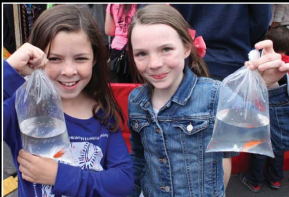
Last chance for goldfish!